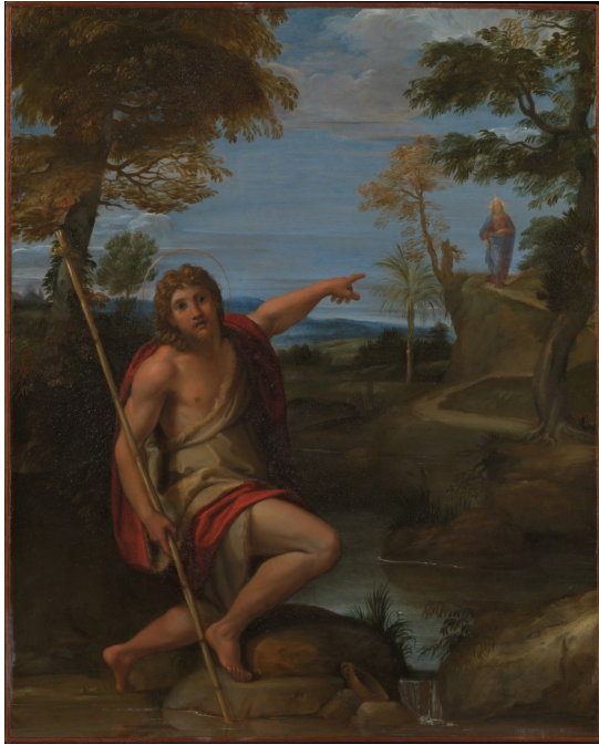
Saint John the Baptist Bearing Witness Annibale Carracci (1560-1609)

It is right for you to give glory in every way to Jesus Christ who has given glory to you; you must be made holy in all things by being united in perfect obedience, in submission to the bishop and the presbyters.